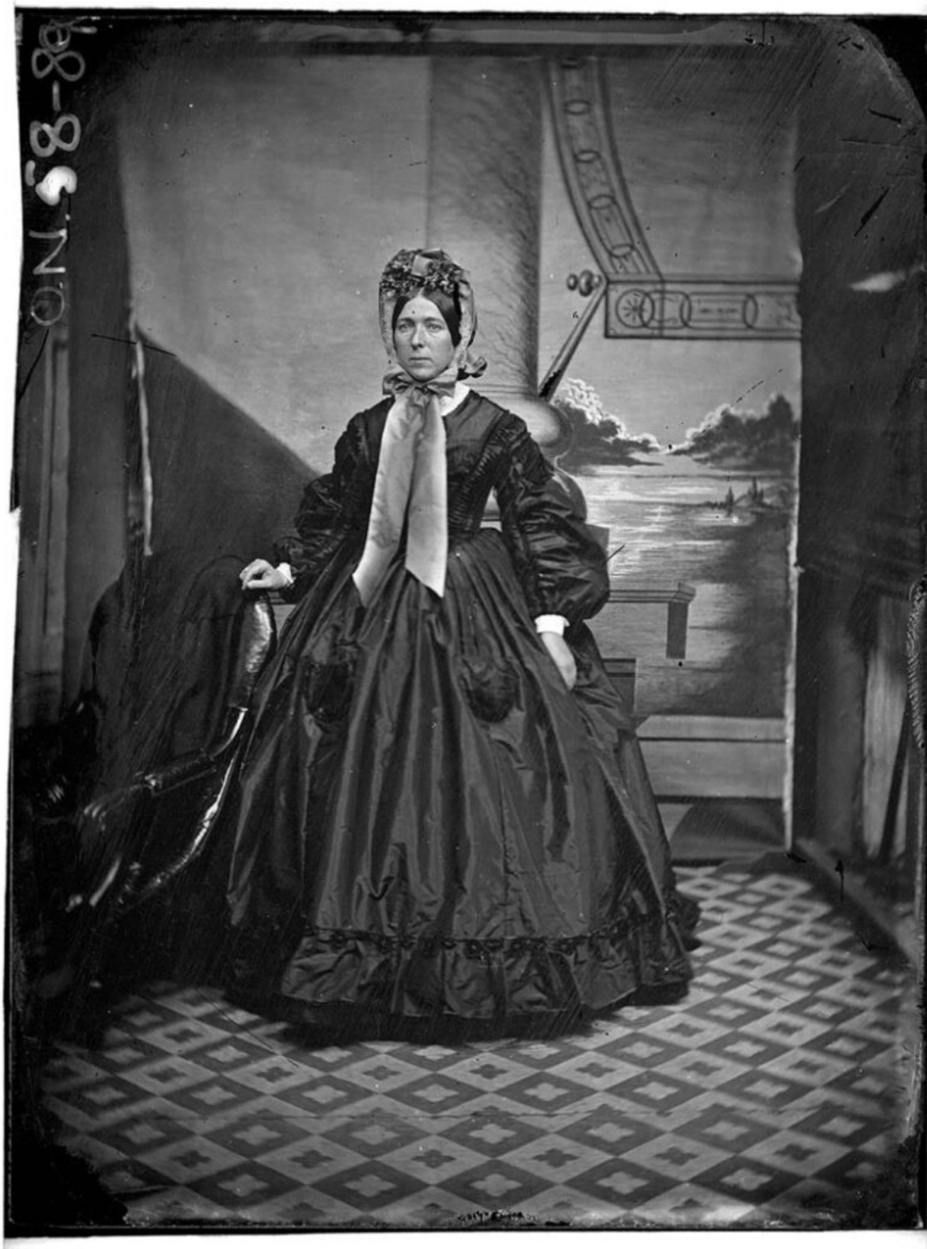
1865 – Fashionable lady, Parramatta