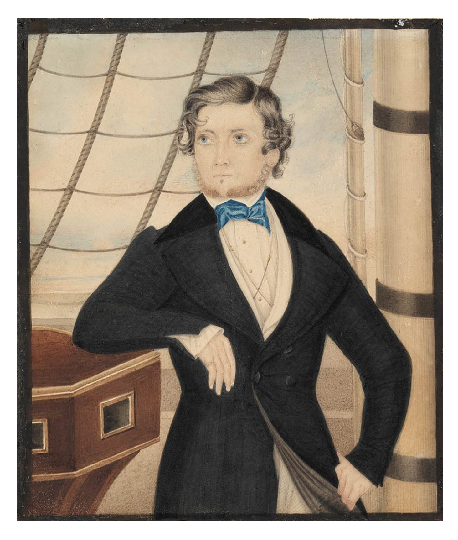
1842 — Portrait of an unidentified man, on board ship