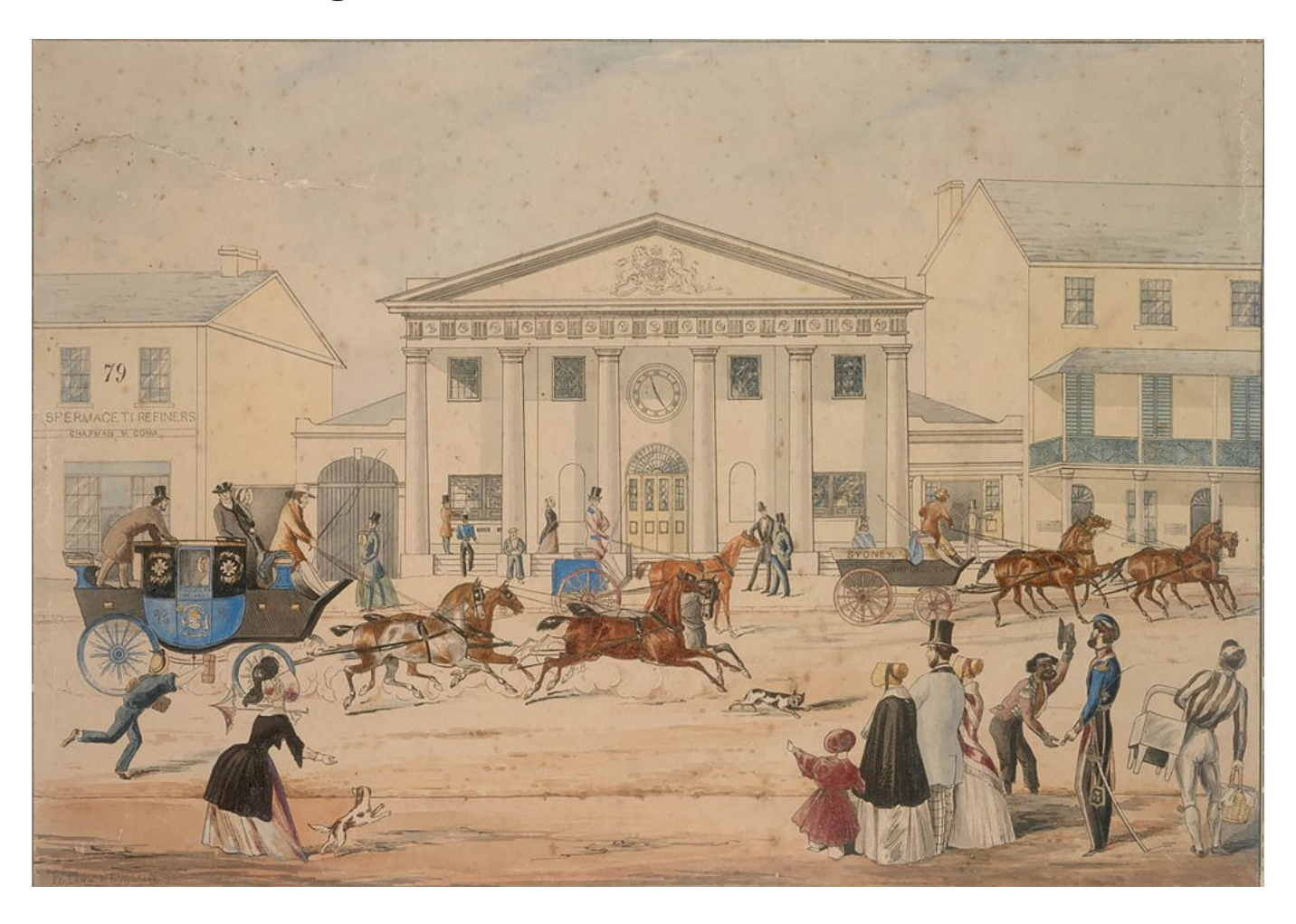
1846 - New Post Office, George Street, Sydney