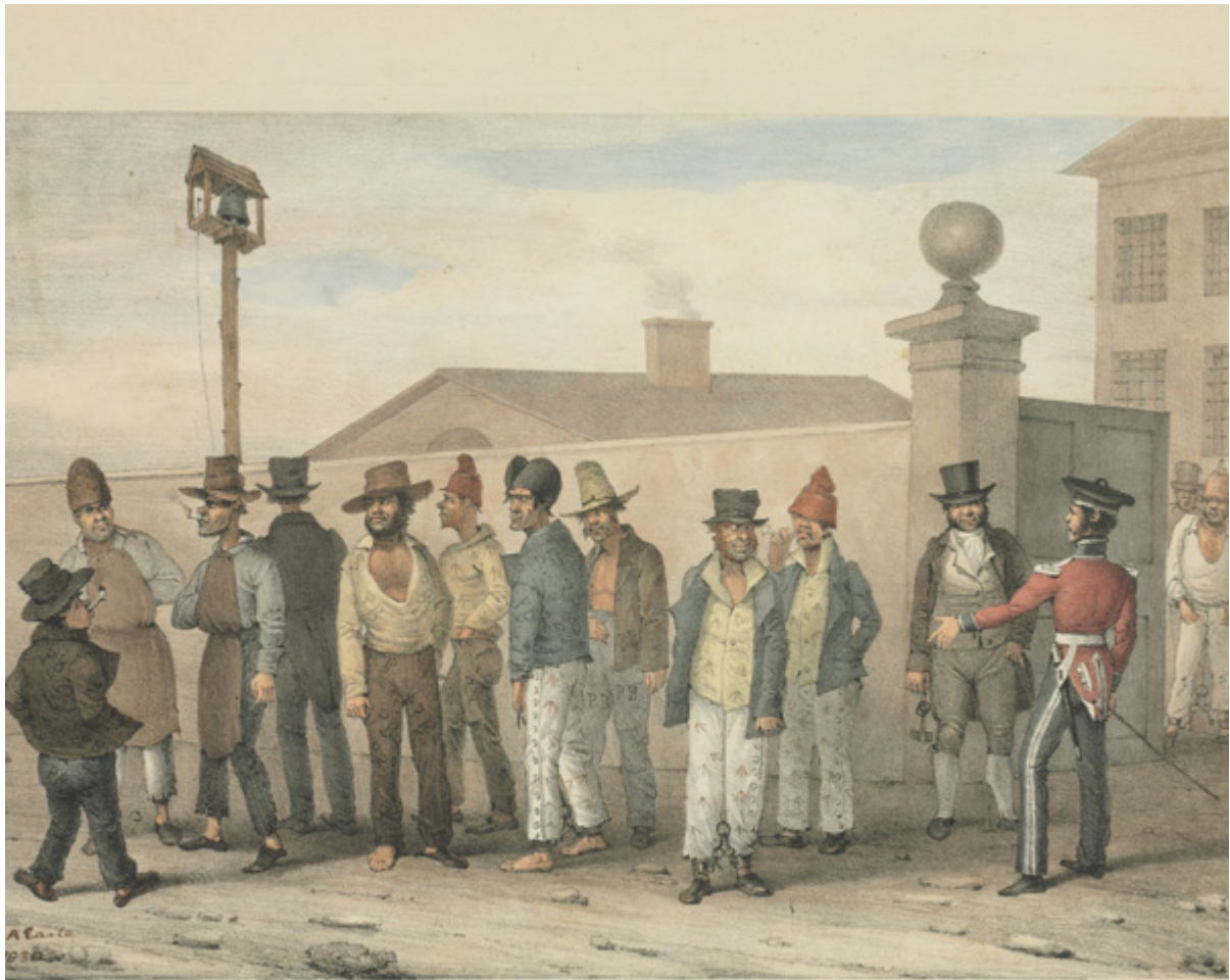
A GOVERNMENT JAIL GANG. Sydney N.S. Wales.