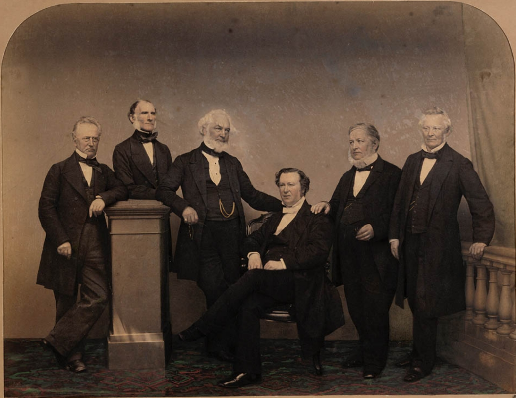
Deacons of First Congregational Church 1886+

CONGREGATIONAL CHURCH. — Deacons of FIRST C.C. old members