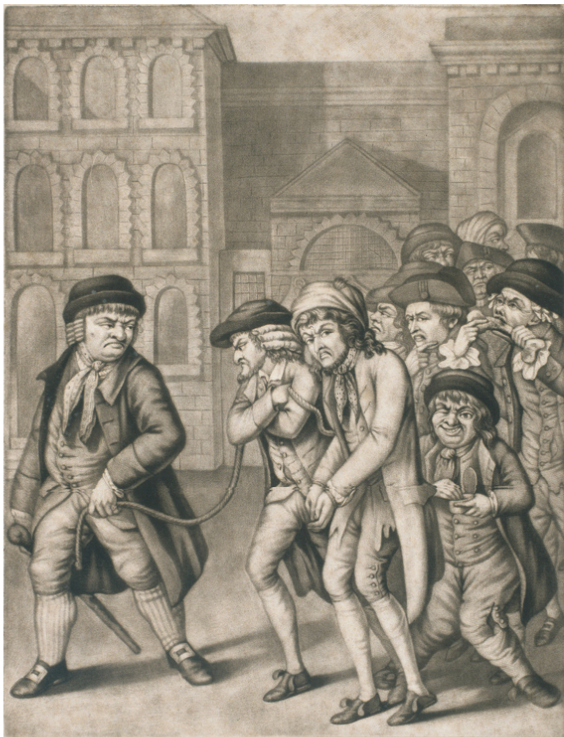
A FLEET of TRANSPORTS under CONVOY.